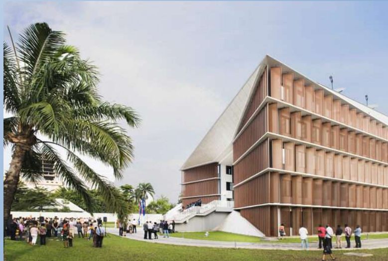
Bioclimatic Embassy of Belgium in Congo