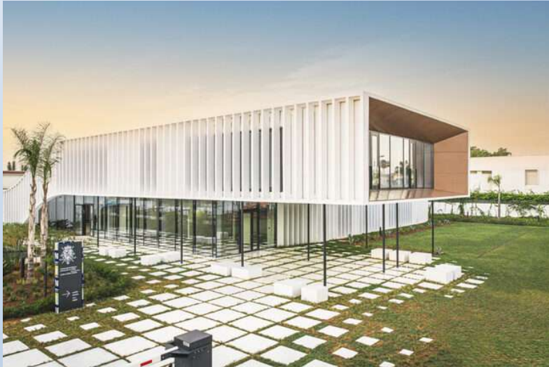
Bioclimatic Embassy of Belgium in Morocco